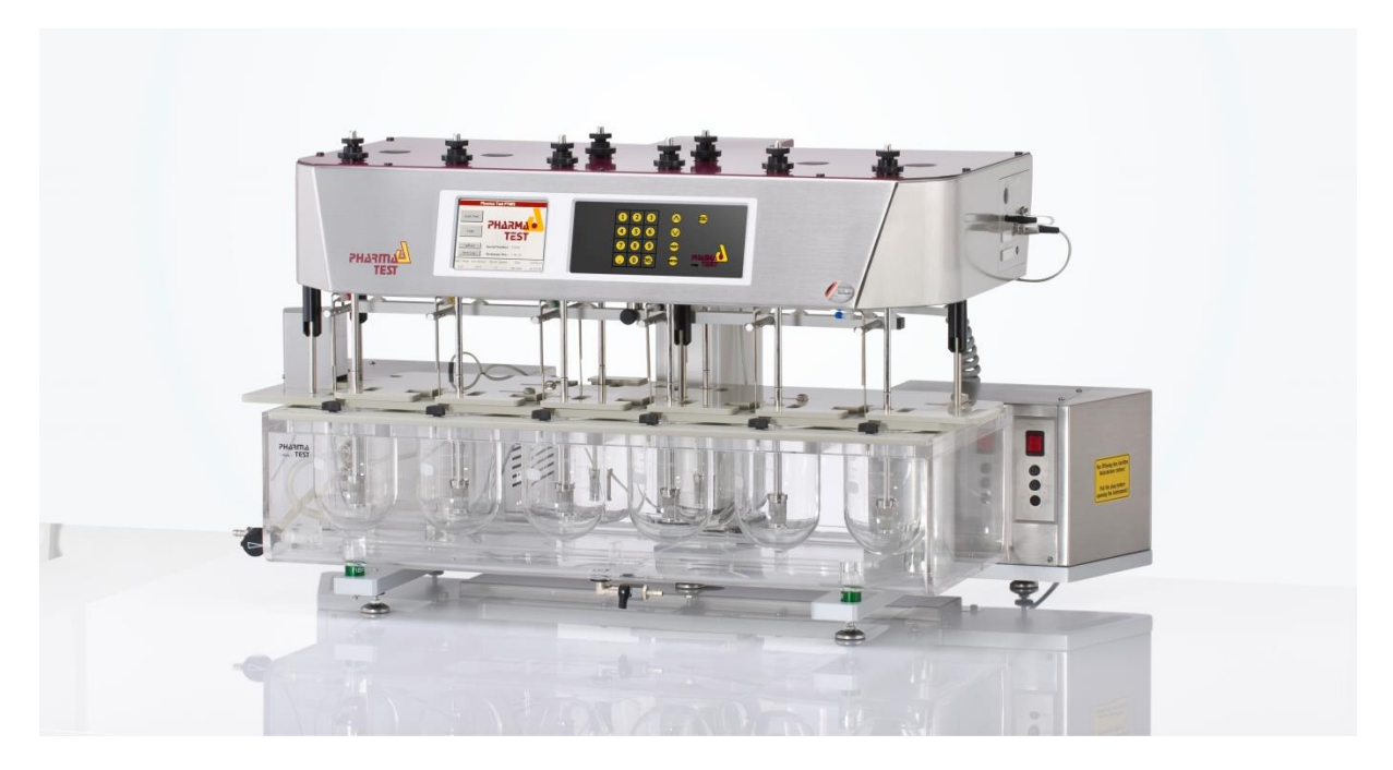
PTWS 620 6 + 2 position, single drive Dissolution Tester

The PTWS 620 is a 6 + 2 position, single drive tablet dissolution testing instrument for solid dosage forms as described in USP chapter <711/724> and EP section<2.9.3/4> as well as the DAB/BP and Japanese Pharmacopeia section <15>. The USP mono-graph <1092/2.4.2> lists visual observation of the dissolution behavior as essential for identifying variables in the formulation or manufacturing process. The six vessels in the front row of PTWS 620 offer optimal visibility of the samples.