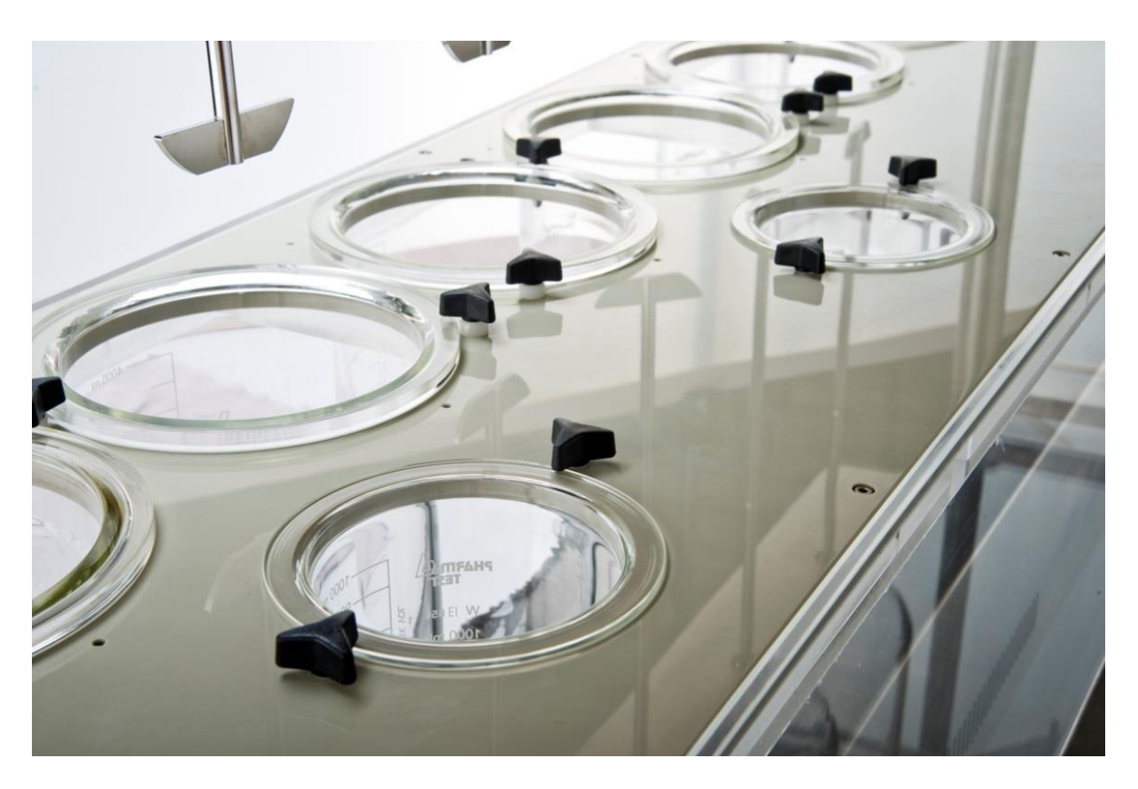
The position of the water bath can be adjusted and fixed easily.