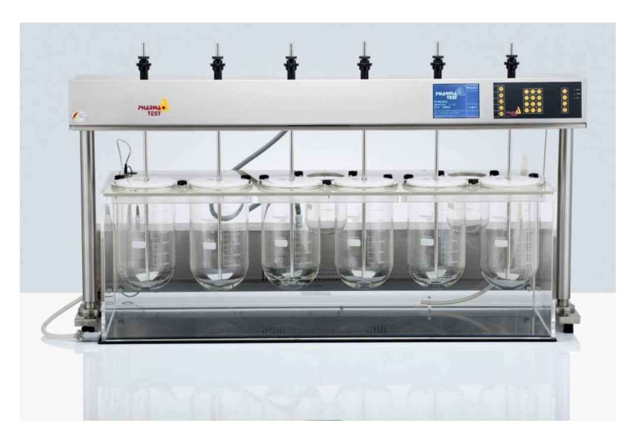
Six vessel in a line

The PTWS 4000 is an ideal instrument for either manual sampling or basic automation. The "six-in-line" vessel configuration means optimal access to the samples for subsequent analysis. Its automated lift-up system moves the drive head into an upper position to remove the vessels and allows for easy cleaning. The U-shaped water bath is separate from the main frame of the instrument and the built-in circulation pump is mounted on a spring loaded assembly to eliminate the transfer of vibration to the dissolution vessels. The instrument features an RS-232 interface for remote control and data transfer to the PT-DL1 data logger to print information of actual stirrer speed and bath temperature.