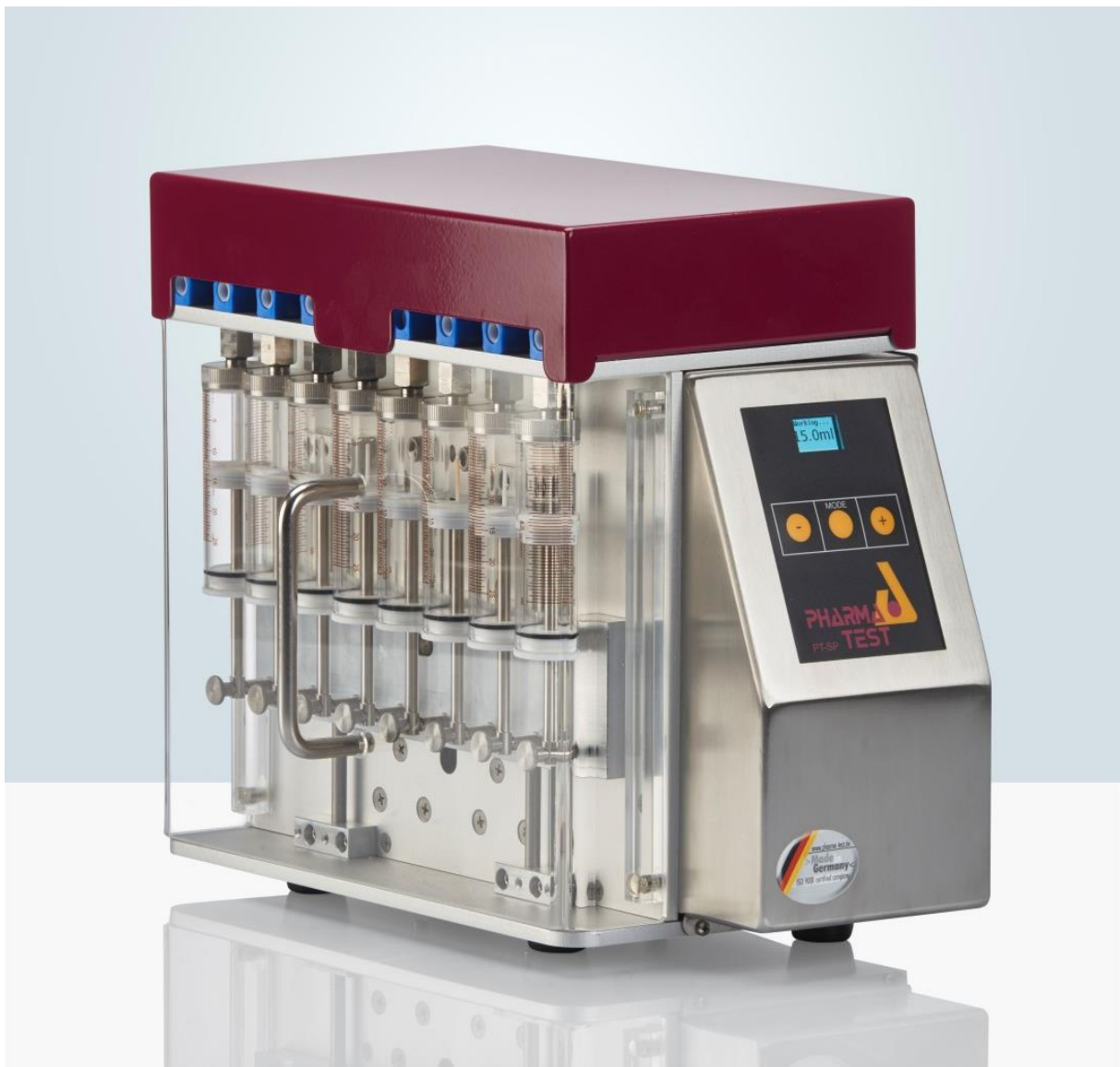
PT-SP Multi Syringe Pump

The PT-SP multi-syringe pump is designed specifically for parallel sample withdrawal and dosage of media from a dissolution bath into open vials inside a fraction collector. It is equipped with up to 8 replaceable 10ml high precision glass syringes. Each syringe is connected to a 3-way pinch valve for media flow control. The drive of the syringes is carried out simultaneously by a stepper motor. All syringes are rigidly connected to the common sturdy drive bar.