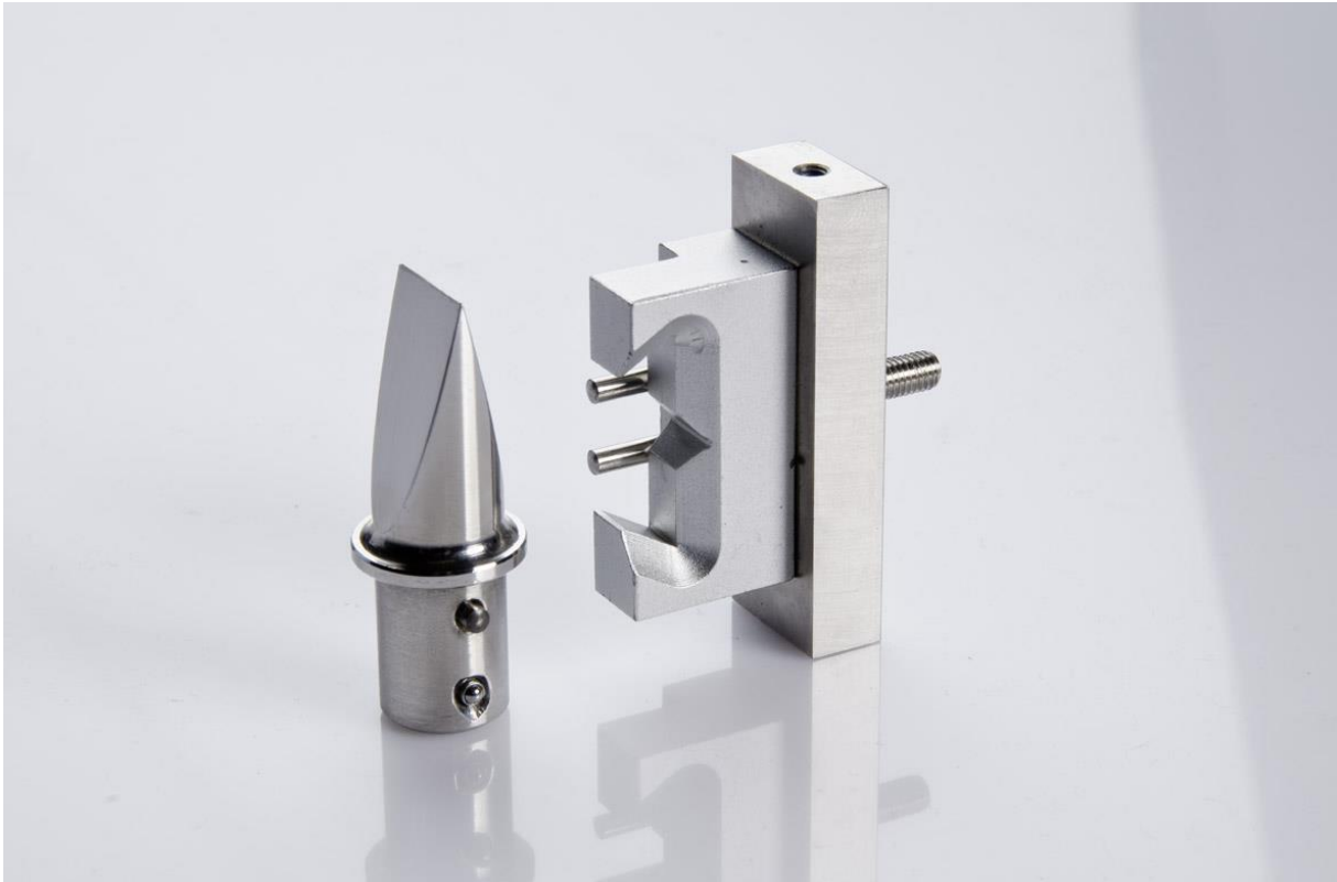
Tension Strength Test Set to test tablets having a break-line (29-28550/52/53/55)