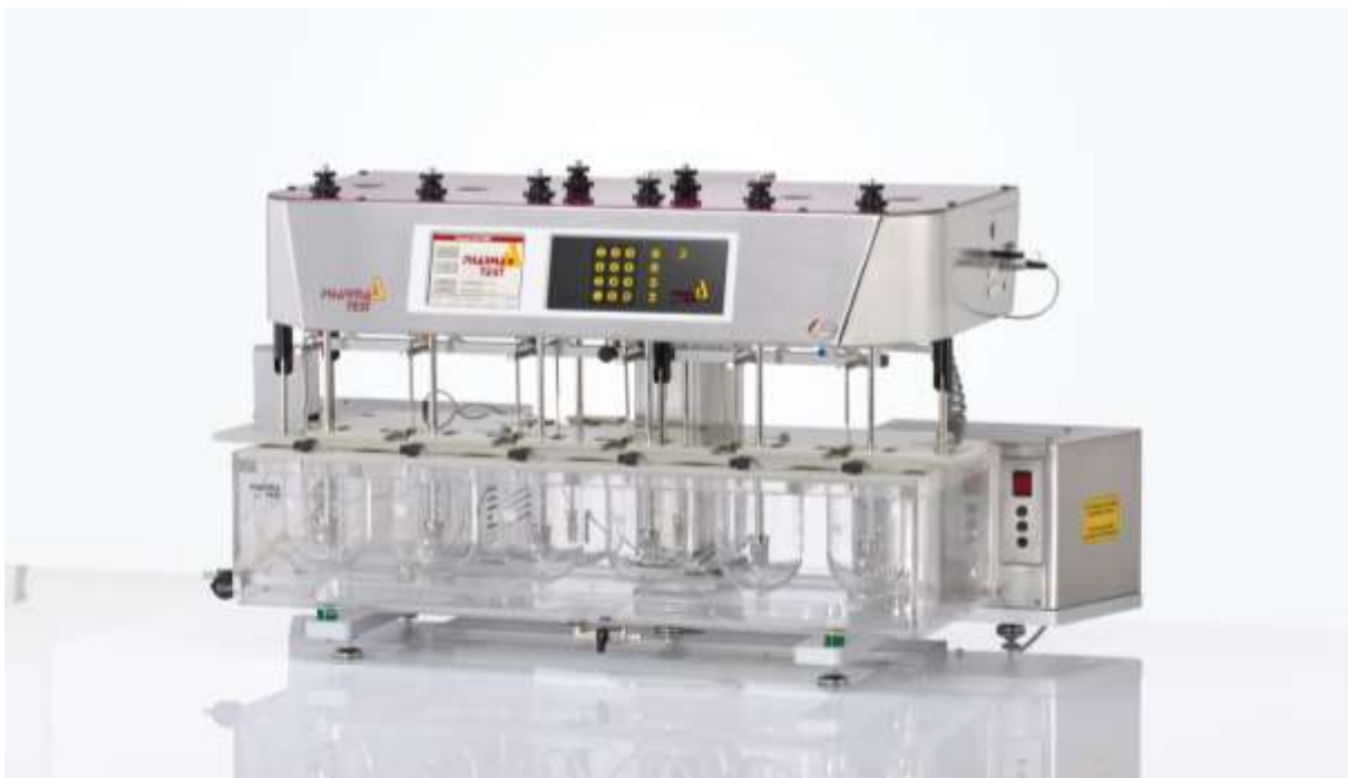
PTWS 620 6 + 2 position, single drive Dissolution Tester

The PTWS 620 is a 6 + 2 position, single drive tablet dissolution testing instrument for solid dosage forms as described in USP chapter <711/724> and EP section <2.9.3/4> as well as the DAB/BP and Japanese Pharmacopeia section <15>. The USP monograph <1092/2.4.2> lists visual observation of the dissolution behavior as essential for identifying variables in the formulation or manufacturing process. The six vessels in the front row of PTWS 620 offer optimal visibility of the samples.