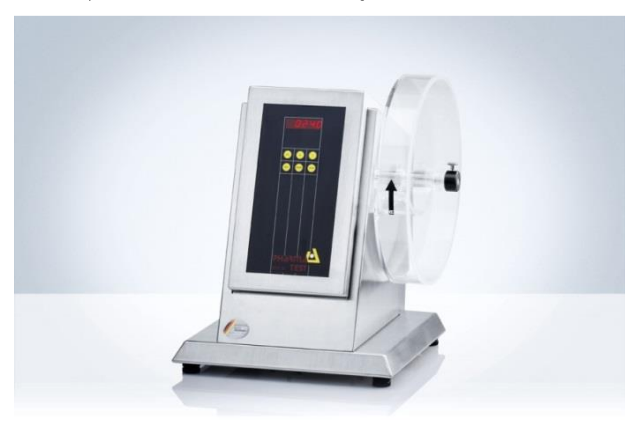
PTF 10E single-drum Tablet Friability Test Instrument

The PTF 10E single-drum tablet friability test Instrument with fixed speed is manufactured in compliance to the USP <1216>, EP <2.9.7> and other Pharmacopoeias. This version is available as single or dual drum instruments.