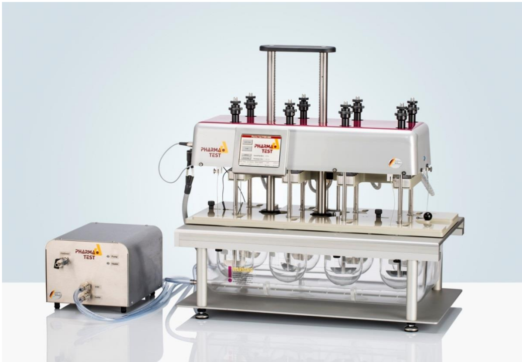
PTWS 820D 8-position Dissolution Tester

The PTWS 820D is an 8 position, single drive compact tablet dissolution testing instrument for solid dosage forms as described in USP chapter <711/724> and EP section <2.9.3/4> as well as the DAB and Japanese Pharmacopeia section <15>.