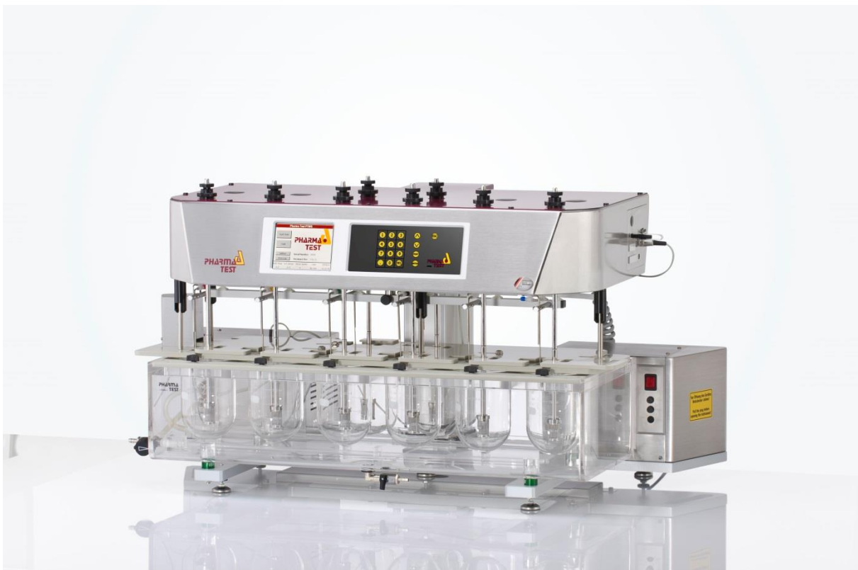
PTWS D620 USP/EP Tablet Dissolution Testing Instrument

The PTWS D620 is a “Dual Drive” 6+6 position, single drive tablet dissolution testing instrument for solid dosage forms as described in USP chapter <711/724> and EP section <2.9.3/4> as well as the DAB/BP and Japanese Pharmacopeia section <15>. The instrument features two additional vessels (approx. 250ml) for media refilling and reference standard media. PTWS D620 features independent stirrer speed control for the front and back row of stirrers.